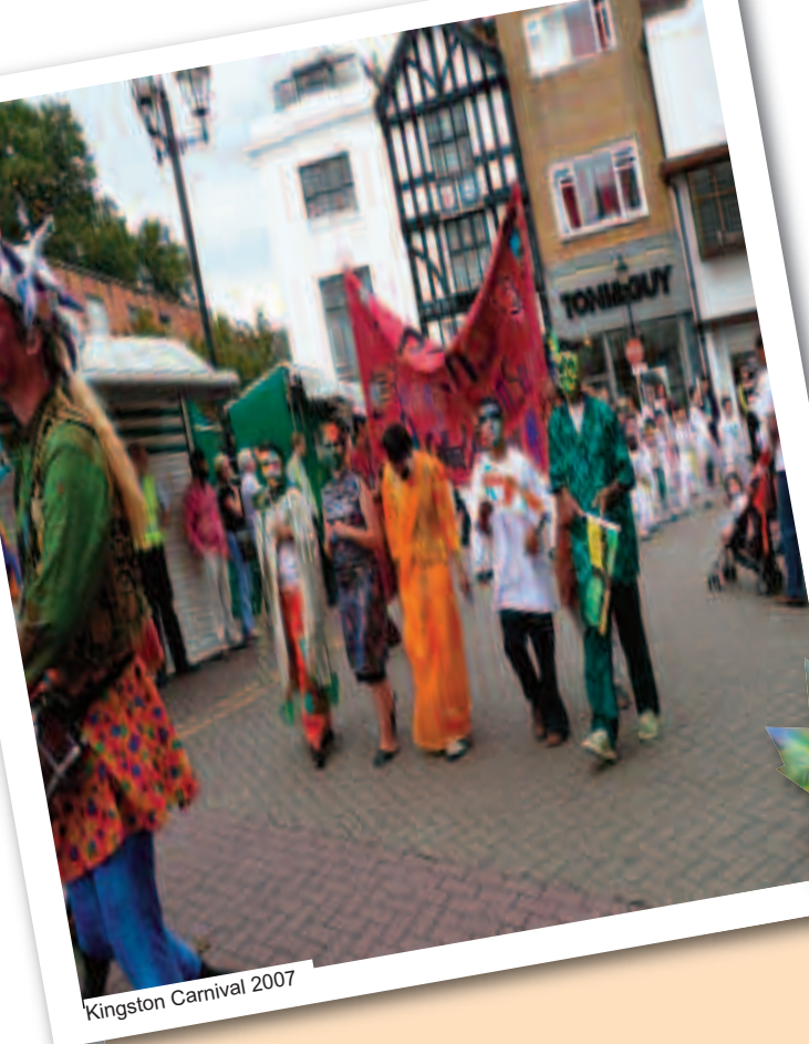
Kingston Carnival 2007

A t last, the day has come. Everyone is still trying to finish off their costumes and outfits, like the woman I can see trying to glue on the feathers, lying about on the floor. The atmosphere is electric. I can see people shaking from nerves but they are over the moon because of the day ahead. As I stand with my group, I know the moment had finally come, we are about to reap our rewards, we are about to stand tall and march in front of thousands of people. If you haven't realised yet, I'm talking about the day we took part in the Kingston Carnival.