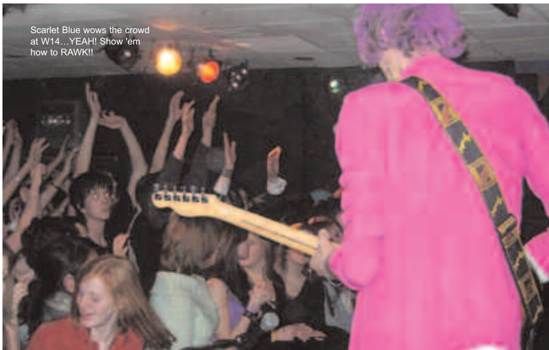
Scarlet Blue wows the crowd at W14...YEAH! Show 'em how to RAWK!!

Hal - Hal (25 Apr) Greatest Hits - Misteeg (25 Apr) Elevator - Hot Hot Heat (25 Apr) Demon Days - Gorillaz (23 May) Don't Believe the Truth - Oasis (30 May) X & Y - Coldplay (6 June) Red Gone Wild - Redman (13 June) Stars of CCTV - Hard-Fi (20 June)